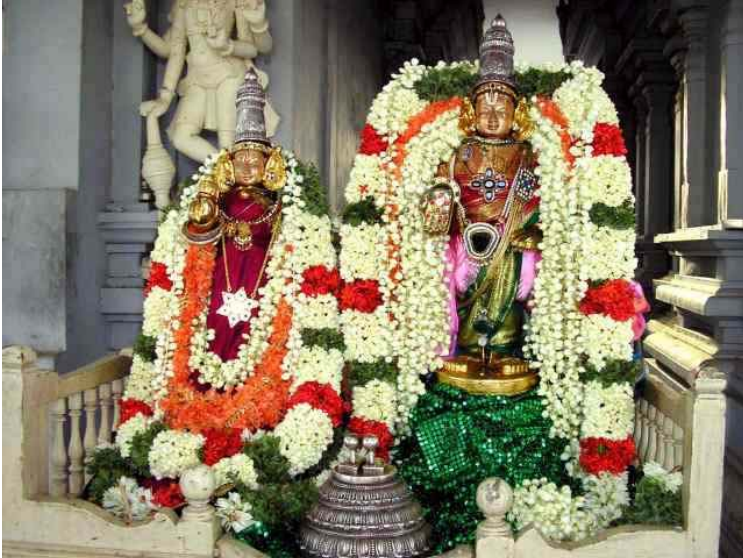
The Divya Mithunam - SrI Oppiliappan - Puzhuthivakkam