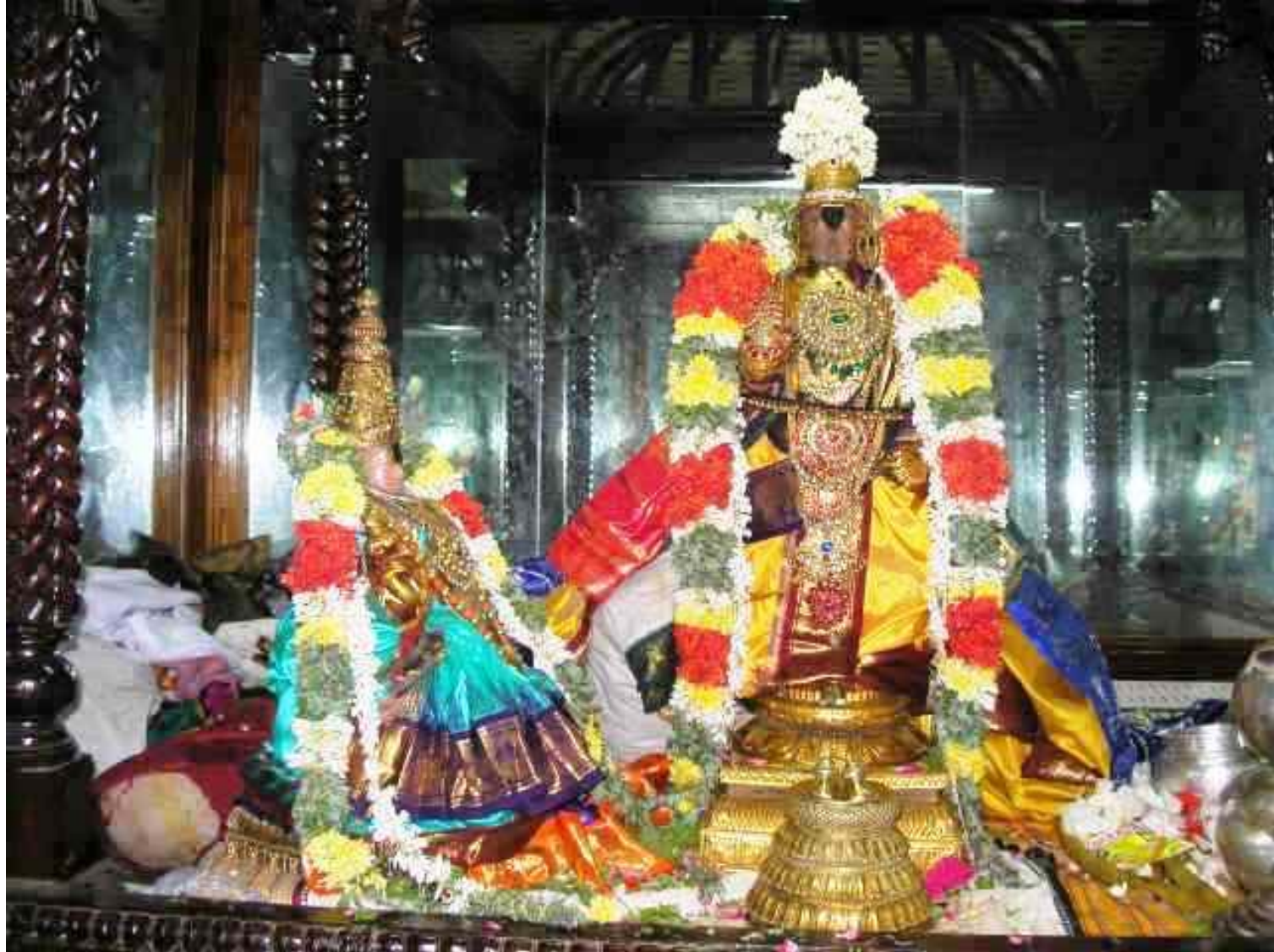
naarAyaNaya nama: - PanguniUthiram serthi in mirror room - thiruvellarai - thanks Sri. Murali Bhattar