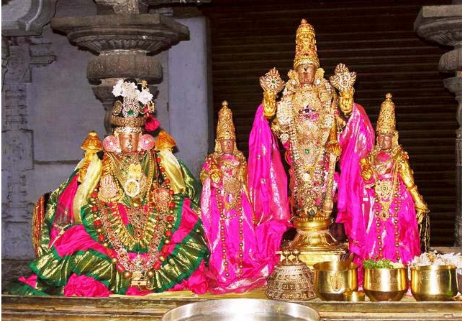
lakshmyA saha hrsheekEsA! - Kanchi MahAnavami sErthi utsavam