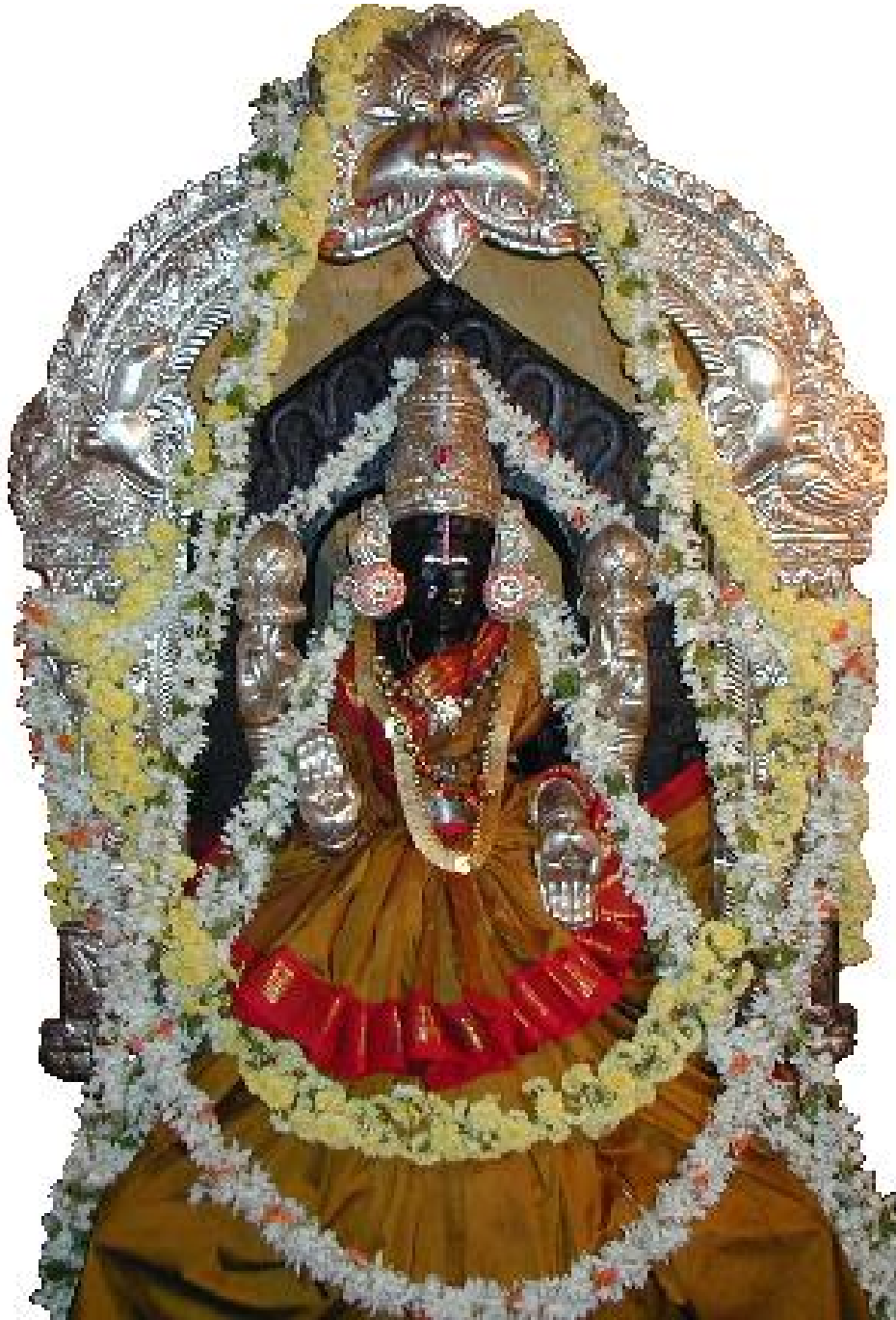
ahObilavalli - Chenchulakshmi thAyAr - ahobilam