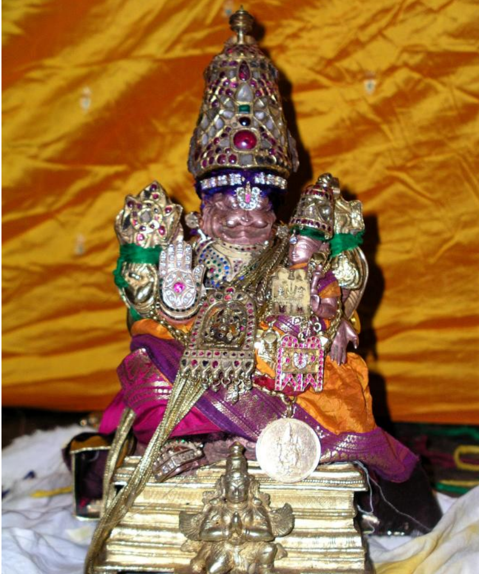
Sundara simham - ahobila mutt